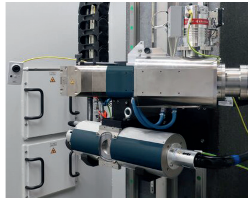
You can switch between the different tubes in one CT sequence.