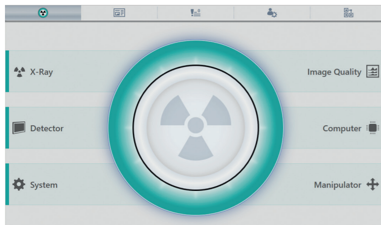
Gemini's Healthmonitor shows the current system condition.

As the single user interface for all workflows, Gemini uses automation, wizards and presets to guide users of different skill levels smoothly through the inspection process. In addition, its powerful CT techniques facilitate the optimum part size spectrum, speed, and image quality.