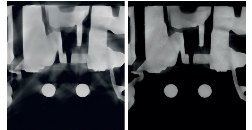
Improving image quality: Cone-beam CT without (left) and with ScatterFix 2.0 (right).

With complex components consisting of plastics and metals, MAR significantly reduces the interfering effects causing the less dense material to 'disappear'.